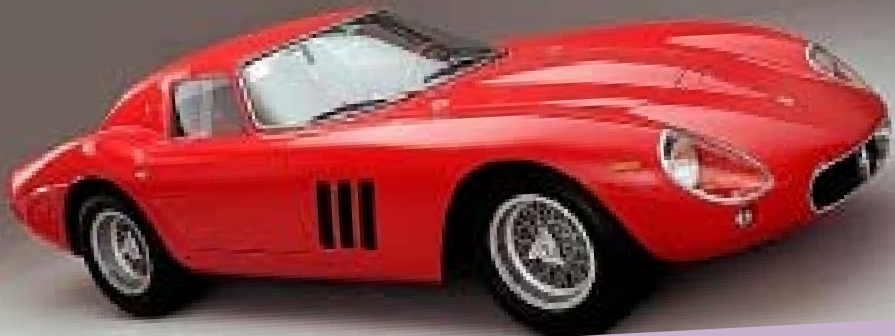
Poetry in motion.. the 250 GTO