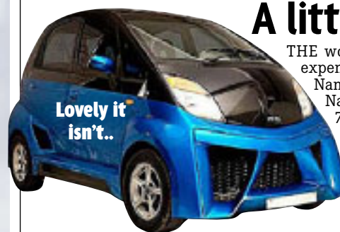
Lovely it isn't..

eight weeks. If you get a recall notice, get your car modified - you won't be covered by your insurance if you don't. Toyota are very good at making the world's most reliable cars, but when it comes to PR, this palaver proves they've got an awful lot to learn.