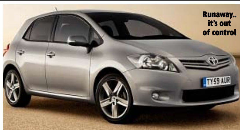
Runaway.. it's out of control