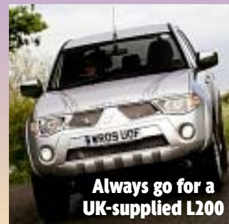
Always go for a UK-supplied L200

Paying a bit more for a UK-supplied car with history and a clear ownership chain is worth it in the long run.