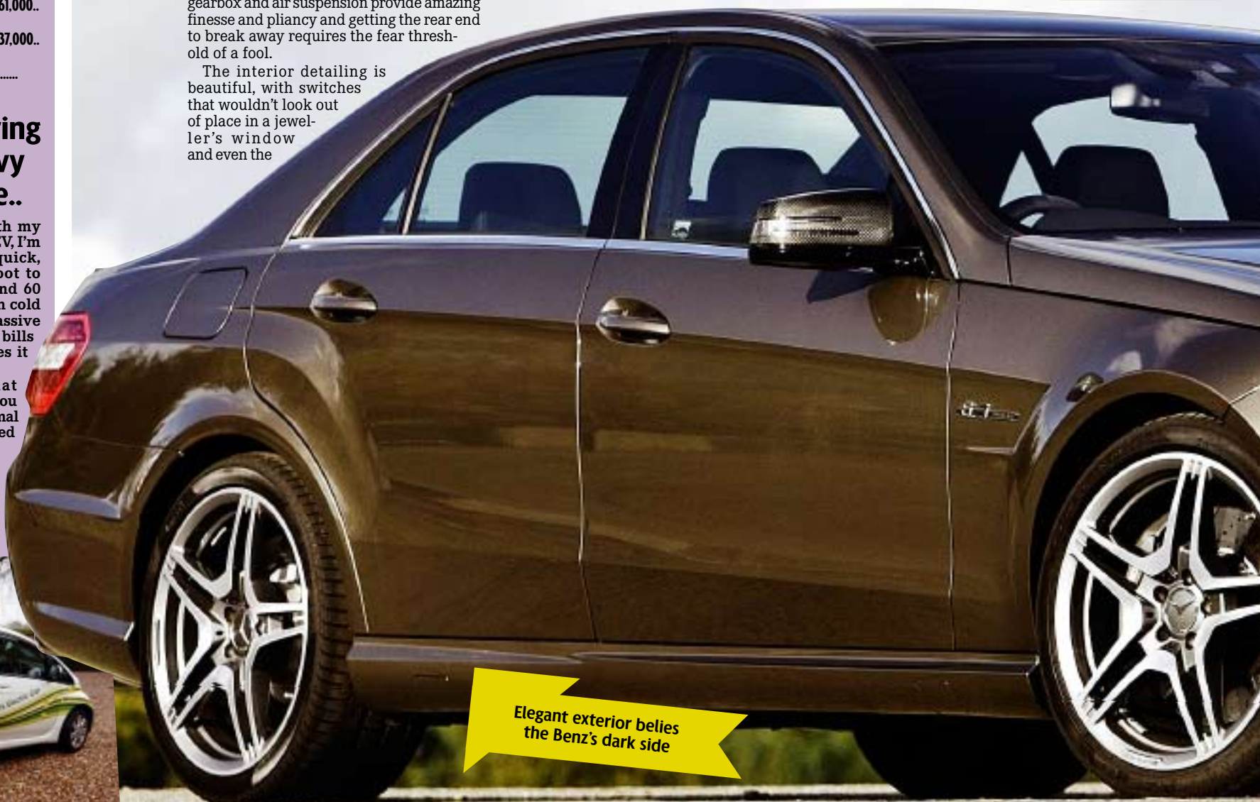
Elegant exterior belies the Benz's dark side

ENGINE: 6208CC V8 POWER: 525BHP 0-60: 4.5 SEC MAX: 155MPH (LIMITED) PRICE: £71,355