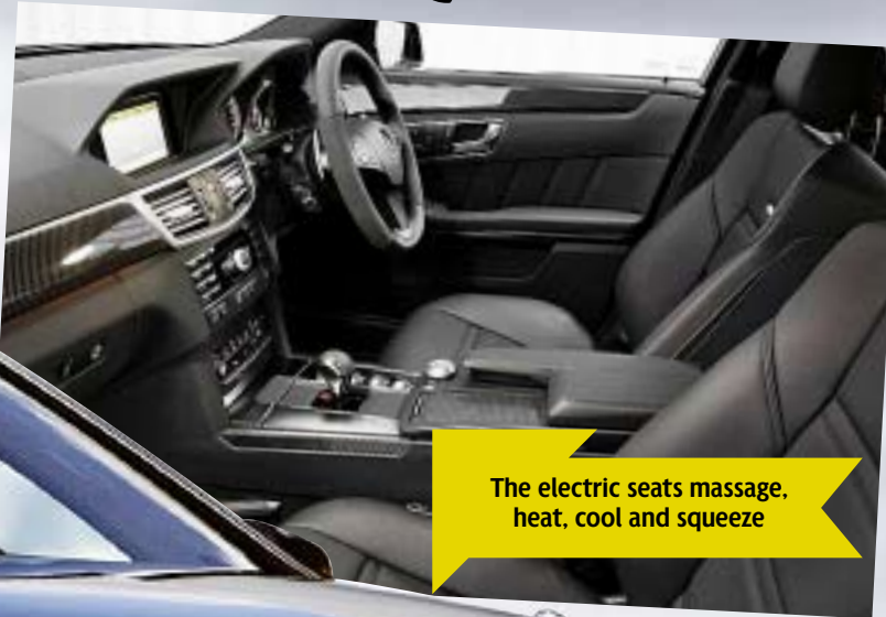
The electric seats massage, heat, cool and squeeze