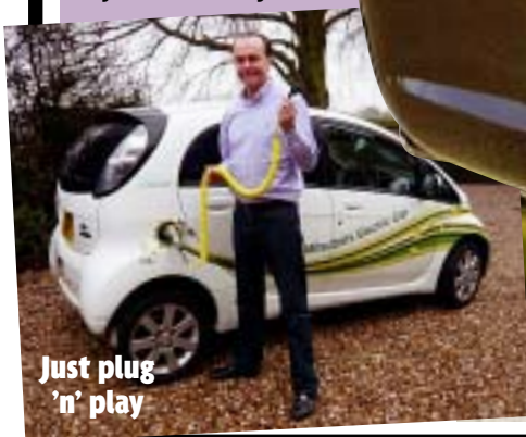
Just plug 'n' play