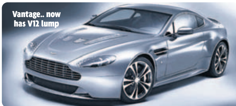
Vantage.. now has V12 lump

Vantage (below) may be the most driver-focused machine AM have made, good for nearly 200mph, but what a time to launch big-buck beltlers like these.