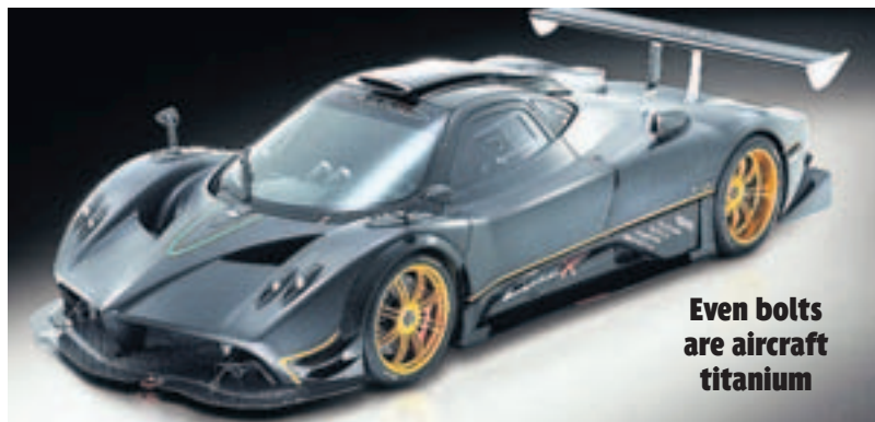
Even bolts are aircraft titanium

and titanium, a lower power-to-weight ratio than a Bugatti Veyron and be able to scorch to sixty in a heart attack-inducing three seconds, but £1.24million is a big ask. Maybe that's why five of the 16 built remain unsold.