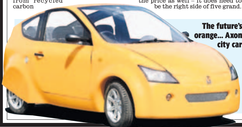
The future's orange... Axon city car

fibre that is 60 per cent lighter than steel. Axon claim its tiny 500cc petrol engine will do an easy 100mpg and could be developed to emit less than 60g/km CO2. Let's hope they subsidise the price as well - it does need to be the right side of five grand.