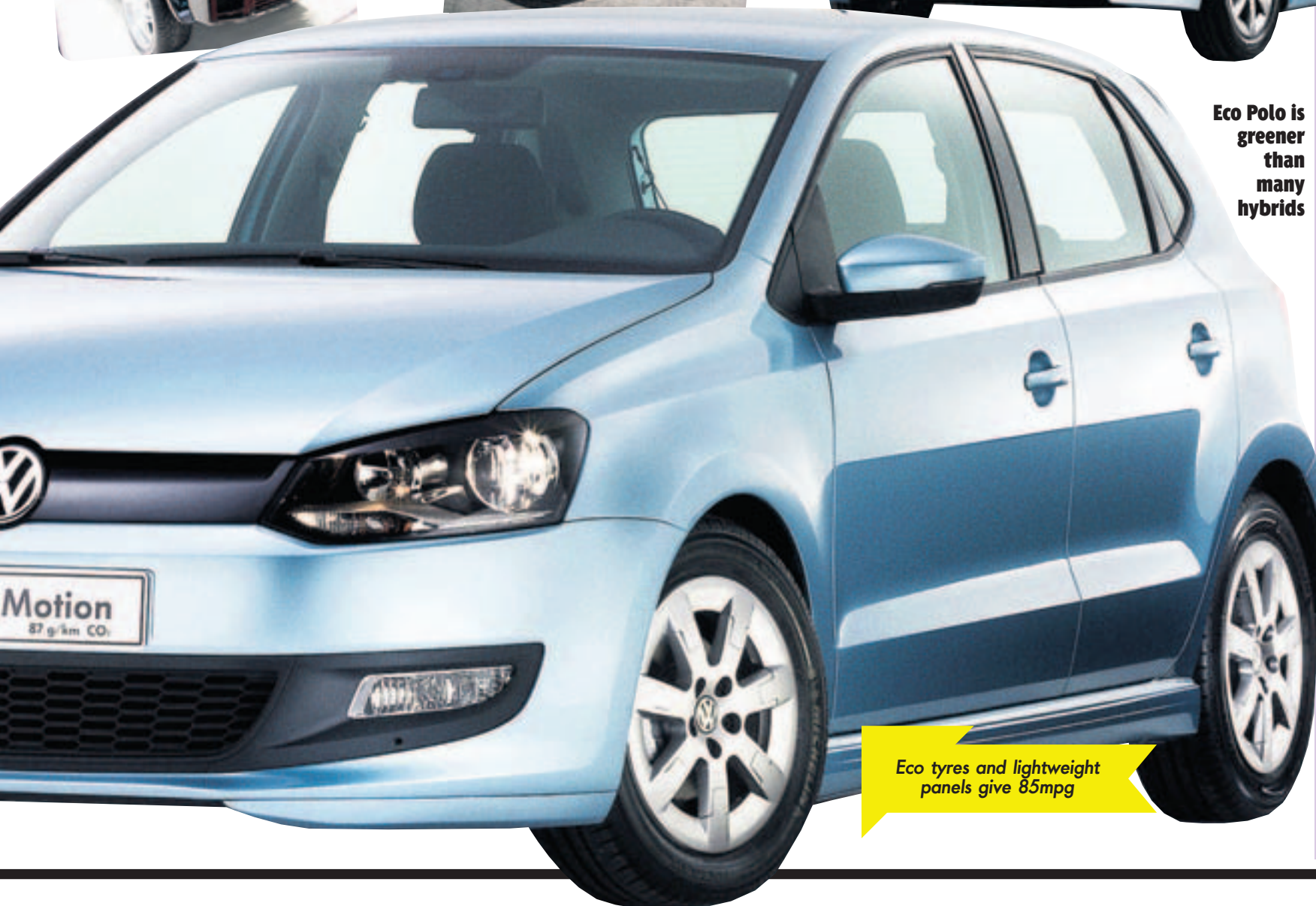
Eco tyres and lightweight panels give 85mpg

AUDITORS for General Motors admit there's "substantial doubt" that the company can carry on trading for much longer. This shock revelation could scupper future bail-outs, and spook banks and suppliers. The General says he needs another $16billion to stop the firm going bust by Easter. All deeply serious, with a million US jobs at stake.