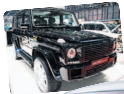
Mad 'n' mighty Brabus, left, & cool Ruf Greenster, right