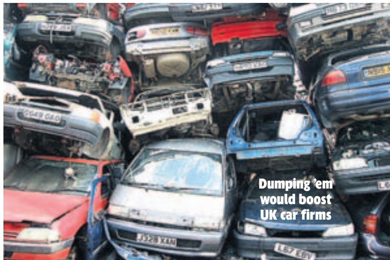
Dumping 'em would boost UK car firms

THE best way to help the UK car market is to do what the Germans have done. Their €2,500 government incentive to scrap old cars has had massive success, with sales up nearly 25 per cent – the strongest February figures in 10 years. And there's no simpler way of getting people into showrooms. The cash acts as a deposit, helps to guarantee finance and, in some cases, would cut the cost of a new car for UK consumers by at least 25 per cent. It's green, fair, easy to understand and absolutely essential.