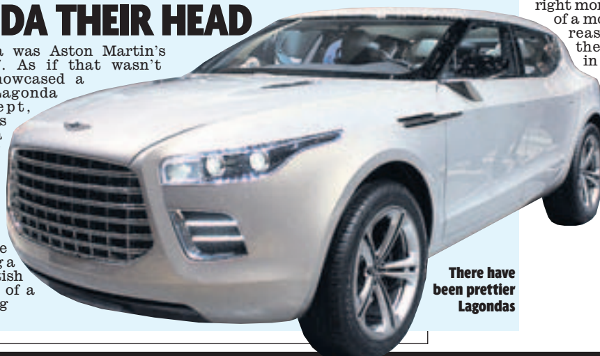
There have been prettier Lagondas

Rather daring, since there have been reports that AM's Kuwaiti co-owners are considering selling a stake in the British company as part of a debt-restructuring package. Ooh-er.