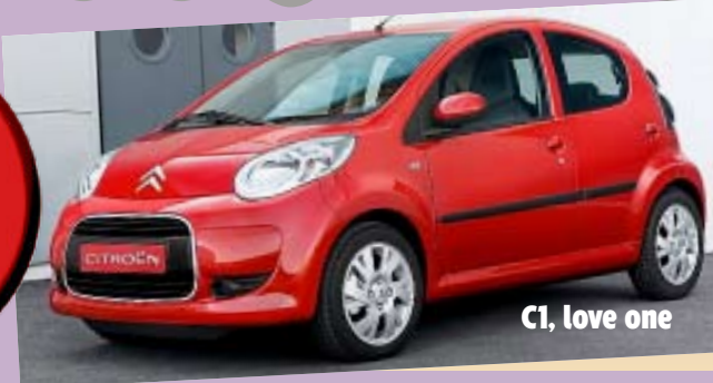
C1, love one