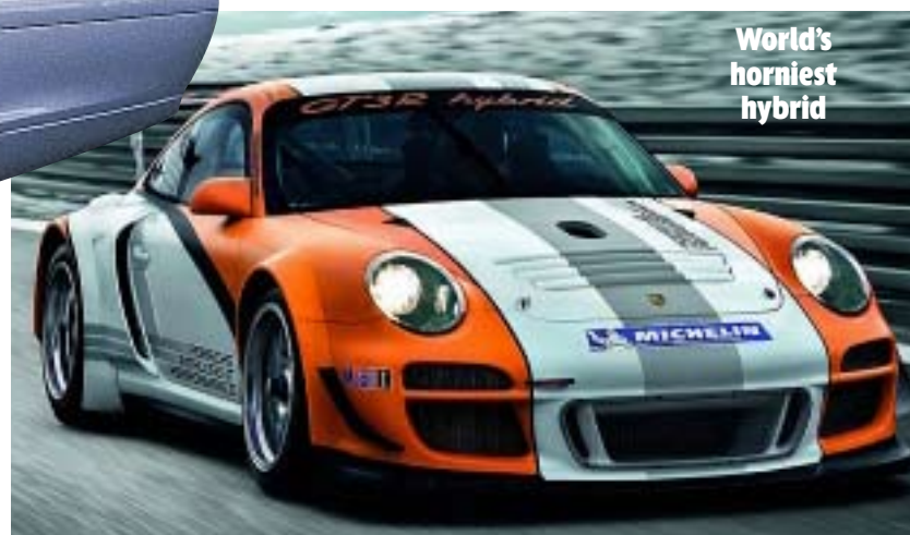
World's horniest hybrid

Could this be the prettiest Proton ever?