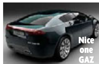
Nice one GAZ

When performance stalwarts like Porsche start going down the eco road, it's a sure sign that green motors are here to stay.