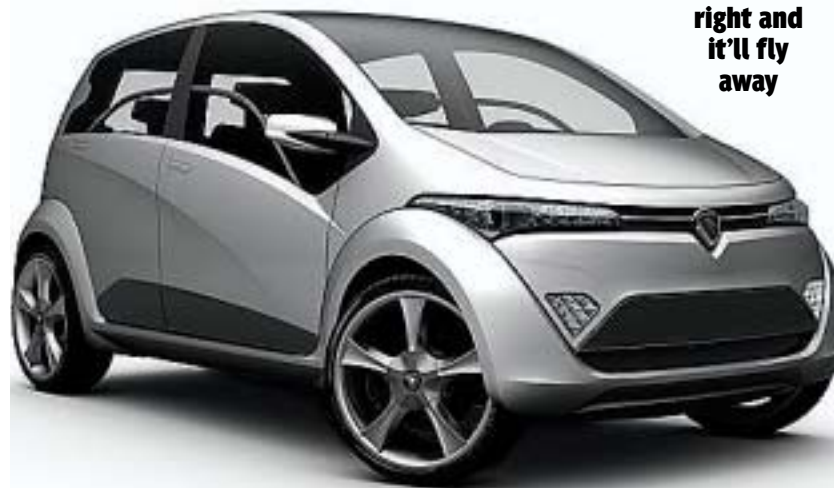
Price this right and it'll fly away

One of the new batch of high driving position/downsized SUVs, it'll have a posh uptown interior and (like the Mini) promises a range of customisable options. A full hybrid diesel drive-train with a rear electric motor will deliver more torque and lower emissions.