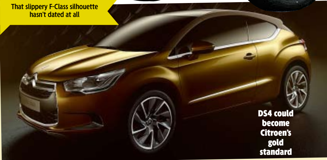
DS4 could become Citroën's gold standard