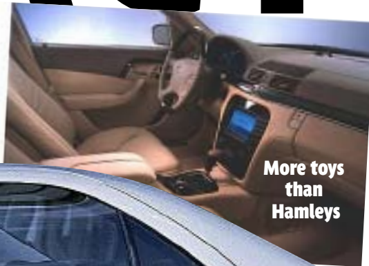
More toys than Hamleys