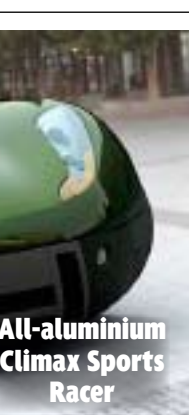
All-aluminium Climax Sports Racer