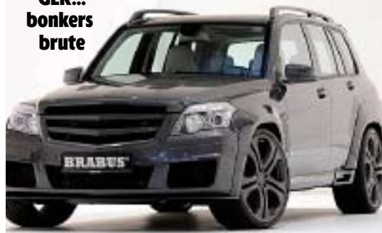
Brabus GLK... bonkers brute

YOU probably don't care, but the world now has an SUV that can do 211mph.