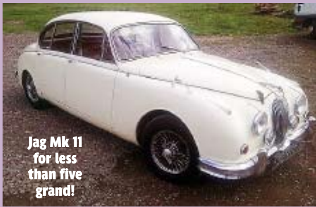
Jag Mk II for less than five grand!