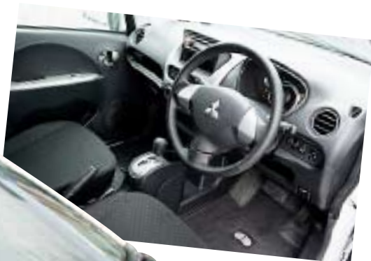
Cabin is ritzy and roomy