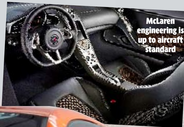
McLaren engineering is up to aircraft standard

So if you've got a few quid to spare, fill out that order form. Like every McLaren road car, this one's likely to go up in price, rather than down. Book early to avoid disappointment.