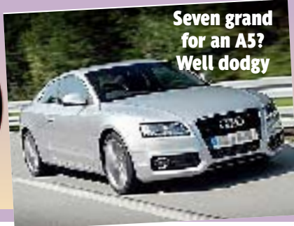
Seven grand for an A5? Well dodgy

Q I CAME across a right-hand drive Audi A5, advertised from Spain. It's the 2.7 version and looks in good condition, but I was puzzled by the low price of £7,000. Do you think it's genuine? Michael Reed, email