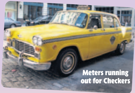
Meters running out for Checkers