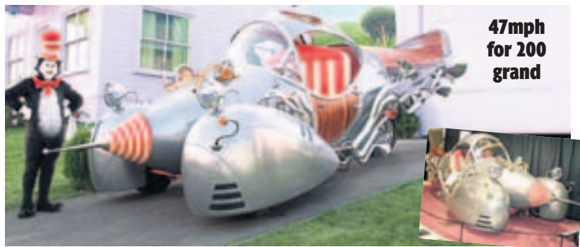
47mph for 200 grand