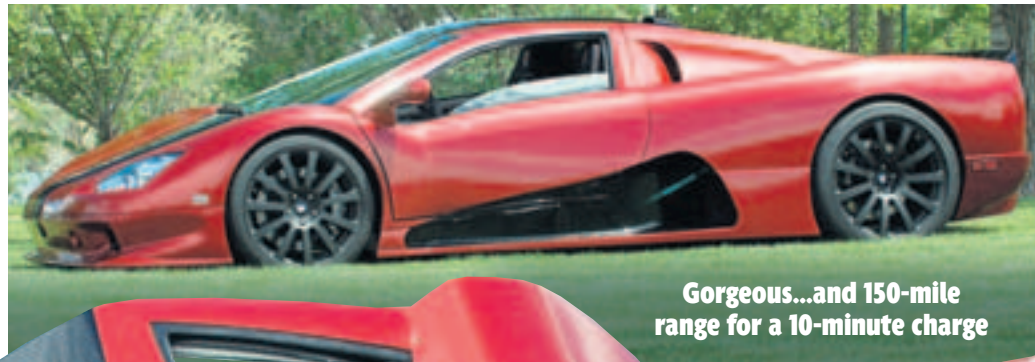
Gorgeous...and 150-mile range for a 10-minute charge