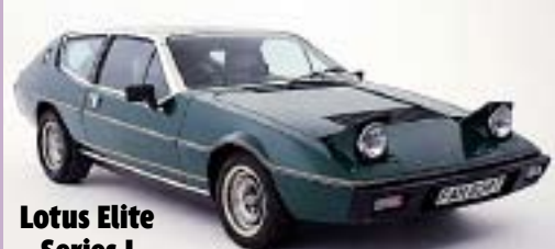
Lotus Elite Series I

THIS one's worth buying. A 1979 Lotus Elite Series I, owned by Lotus boss Colin Chapman, is up for sale next Friday at Goodwood.