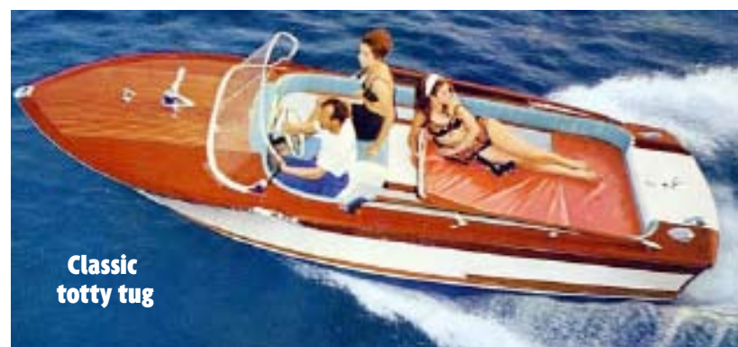
Classic totty tug