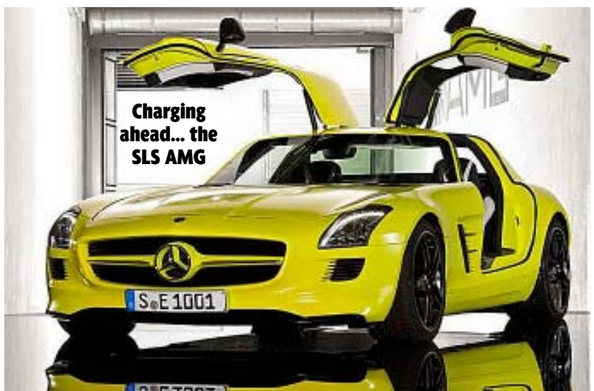
Charging ahead... the SLS AMG

THURSDAY night at Sir Elton John's White Tie and Tiara Ball saw an Audi A1 sell for a staggering £350,000. Mind you, it was no ordinary Audi, but made over by controversial dauber Damien Hirst. With a stock A1 at about £15k, £335,000 must rank as the priciest paint job ever. Good luck selling that one in 10 years.