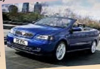
Sir Elton & David Furnish raising money for their AIDS charity