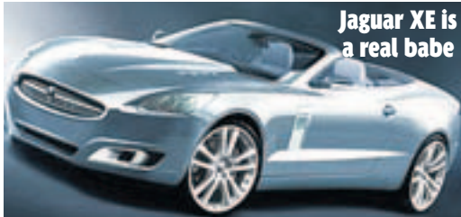
Jaguar XE is a real babe

And for the rest of the day Peugeot sent several score of journalists up in gliders at the club in Stratford-upon-Avon without using a single drop of fuel.