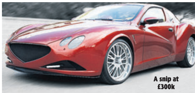
A snip at £300k

HOW'S this for bad timing? Italian coachbuilder Faralli and Mazzanti couldn't have picked a worse moment to launch their Vulcan S supercar. It may have a V12 lump that produces a mighty 630bhp, a hand-