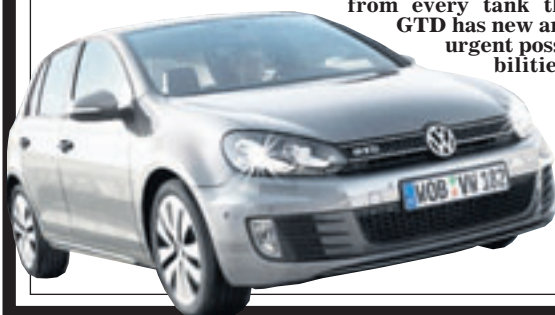
New Golf GTD is credit crunch cool

VW really are in tune with the times. Their ultra-frugal BlueMotion range has been a jumbo hit and last Friday they unveiled a warmed-up Golf diesel that can manage 53mpg and emits only 139g/km CO2. Sixty isn't that fast at seven-and-a-bit seconds, while top speed is a respectable 138, but with 640 miles from every tank the GTD has new and urgent possibilities.