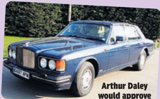
Arthur Daley would approve