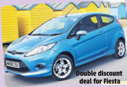
Double discount deal for Fiesta