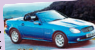
Porsche Boxster. All three are a joy to behold and completely painless to live with.

you couldn't have picked a better time to buy. Five grand buys a 2000X Mercedes SLK230 auto (below) or an 02-plate Mazda MX-5. If you're really lucky, you might even be able to pick up an early R-plate