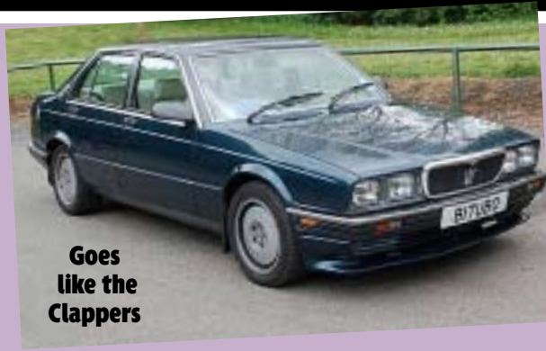
Goes like the Clappers