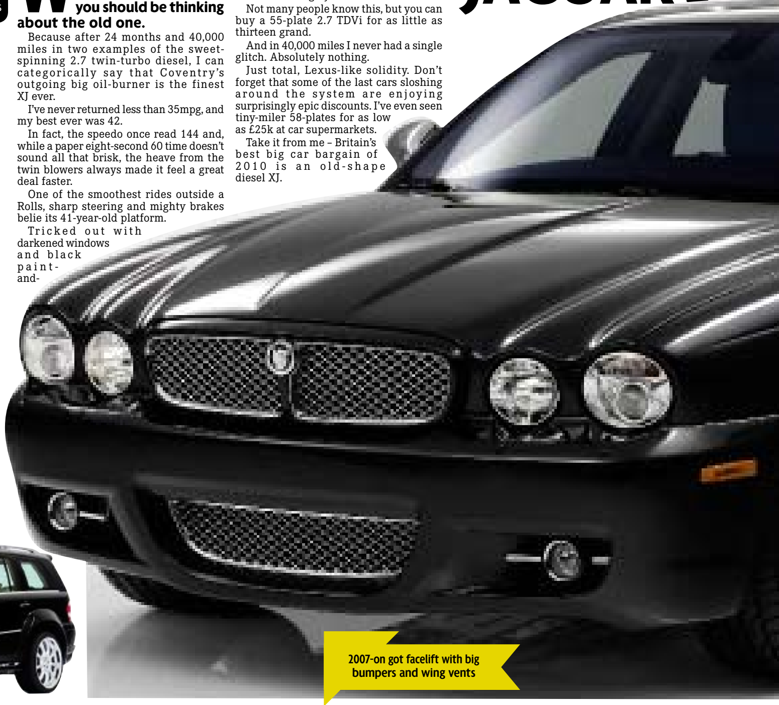
2007-on got facelift with big bumpers and wing vents