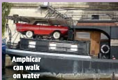
Amphicar can walk on water

EVEL Knievel must have made a good few quid, because in the 70s he owned an ultra-rare '73 Ferrari Daytona Spider, which back then cost the price of a large house. It's estimated to make close to £1million when it goes under the hammer at RM Auctions in Arizona next January. Bet he wished he'd kept that one.