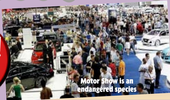
Motor Show is an endangered species