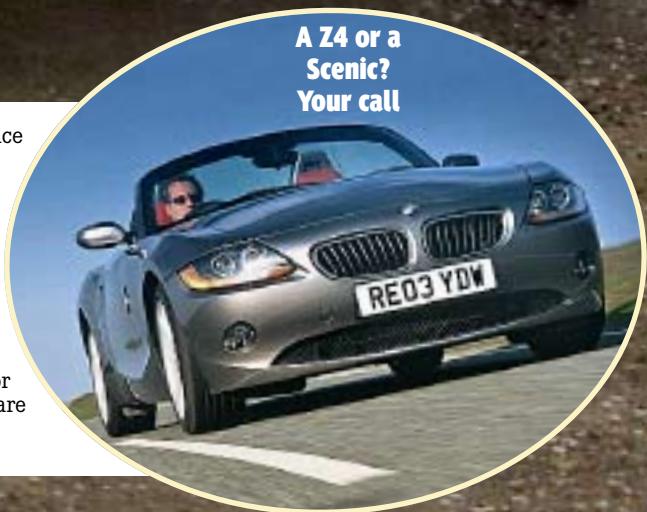
A Z4 or a Scenic? Your call

So if you fancy some open-top optimism for next year, the next couple of months really are the right time to get stuck in.