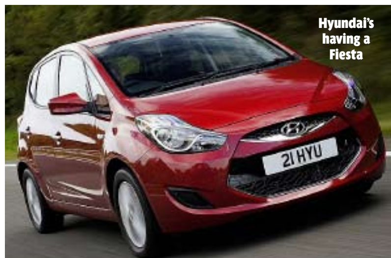
Hyundai's having a Fiesta