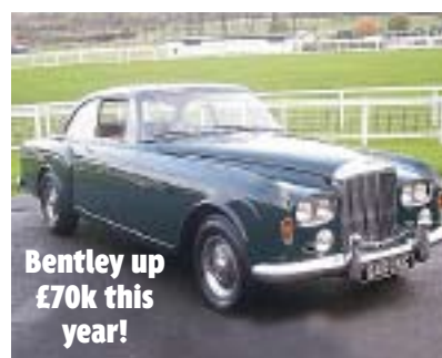
Bentley up £70k this year!

All of which means the ix20 will sell seriously swiftly, believe you me.